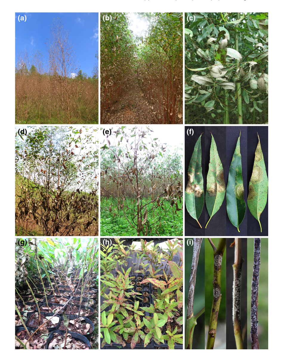
FIGURE 1 Disease symptoms on Eucalyptus spp., including hybrids of E. urophylla with E. grandis (a, b, and d), E. tereticornis (c and f), and E. pellita (e) caused by species of Calonectria. (a)-(f) Disease symptoms in Eucalyptus plantations. (a) Tree death after infection. (b) Defoliation associated with leaf and shoot blight. (c) Early stage of leaf blight after infection. (d) and (e) Leaf blight. (f) Typical blight symptoms on leaf front and back. (g)-(i) Disease symptoms on Eucalyptus nursery plants. (g) Stems of infected E. urophylla × E. tereticornis hybrid seedlings. (h) Leaves of infected E. urophylla seedlings. (i) Stems of E. urophylla × E. grandis hybrid seedlings blackened due to rot and covered with profuse white sporulation of the pathogen

Most studies on Calonectria have focused on the taxonomy, phylogeny, and pathogenicity of species (Lombard et al., 2010c, 2016; Marin-Felix et al., 2017). However, with the development of molecular biological techniques in recent years, our understanding of Calonectria has changed dramatically. The aim of this review is to illustrate how data relating to genes and genomes have significantly changed and influenced our understanding of the taxonomy and population genetic diversity in Calonectria . We also consider how a