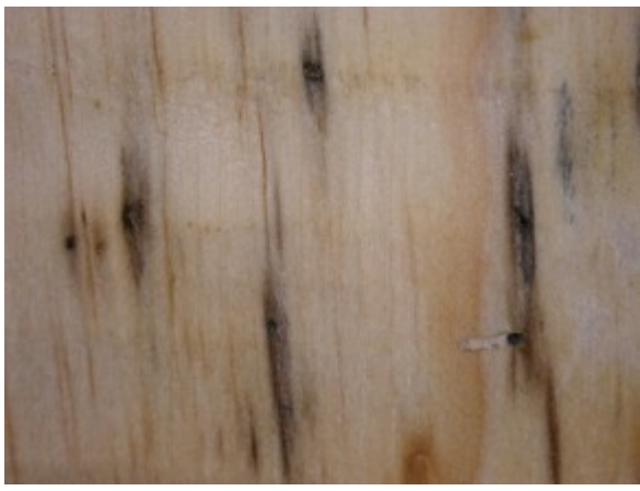
Fungal stain associated with tunneling of ambrosia beetles