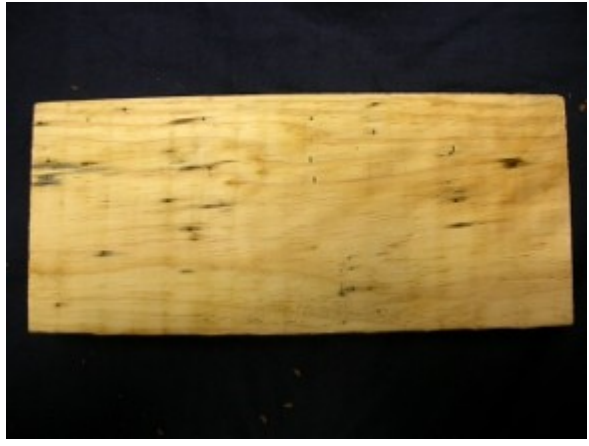
Section of wood showing multiple tunnels