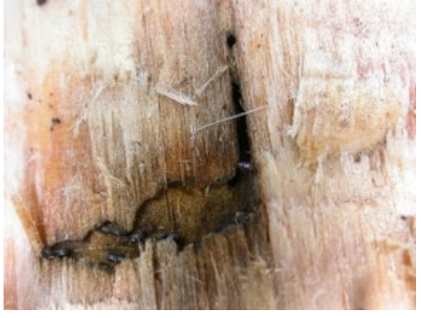
Xyleborinus saxeseni beetles boring in wood