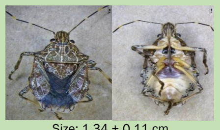
Size: 1.34 \pm 0.11 cm