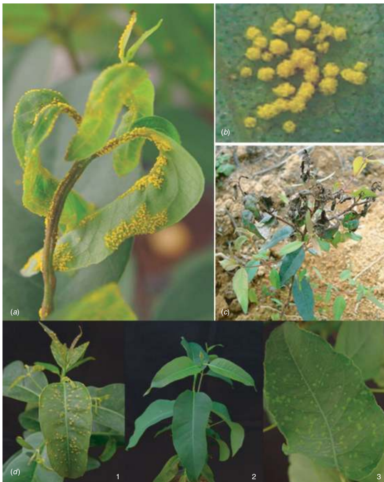
Fig. 1. Puccinia psidii infection on eucalypt. (a) Urediniospores on leaves and shoots. (b) Urediniospore pustules. (c) Apical death. (d) Resistance reactions: (1) susceptible, (2) resistant and (3) hypersensitive response.

18–21°C gave the highest germination rate for urediniospores from S. jambos , whereas those from P. guajava had the highest germination rate at 15°C (Aparecido et al. 2003a).