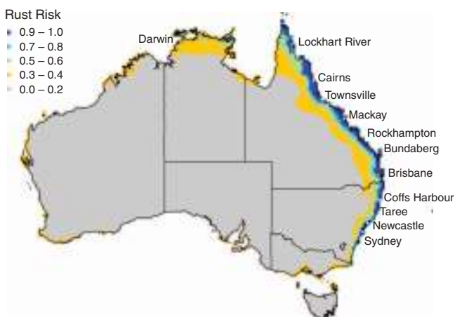
Fig. 4. Revised rust risk areas for Puccinia psidii in Australia (T. H. Booth and T. Jovanovic, pers. comm.). Dark blue areas represent highest risk, light blue, light green and orange areas show decreasing levels of risk. Grey areas signify lowest risk.

Another caveat associated with the current risk mapping is that the presence of a highly susceptible host is important