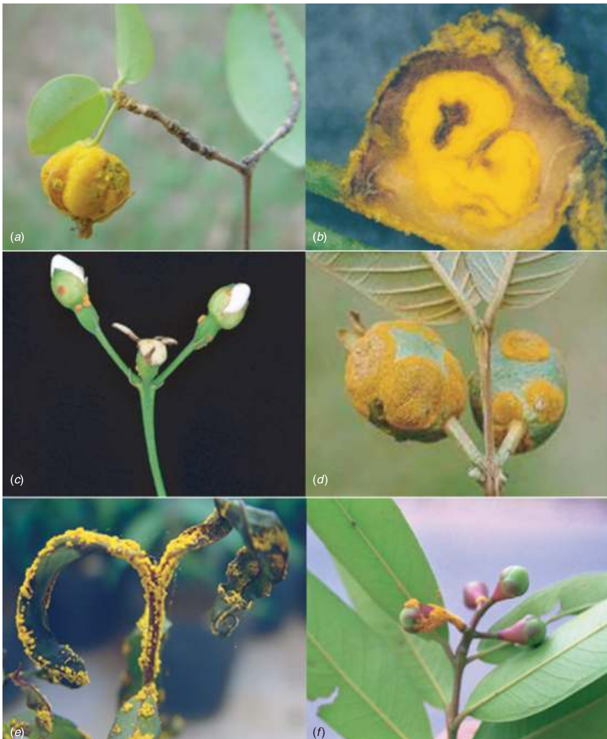
Fig. 2. Rust on other Myrtaceae species. (a, b) Infected fruit of Eugenia uniflora . (c, d) Flower buds and guava fruit. (e, f) Urediniosori on leaves and flower buds of Syzygium jambos .

produced on E. grandis seedlings exposed to 3640 lx than on those exposed to 1092 lx (Ruiz et al. 1989a, 1989b). In this study, infection and spore production were not affected by the source (host species or location) of the inoculum.