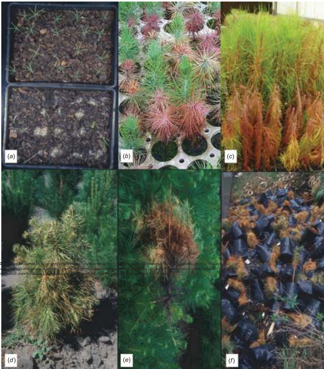
Fig. 2. Symptoms caused by Fusarium circinatum in young pine seedlings: (a) tray with 30 of germinated Pinus pinaster seedlings; (b) wilted and dead P. patula seedlings after natural infection; (c) inoculated pine seedlings showing dieback symptoms; (d) young P. radiata tree showing dieback of branch tips; (e) branch showing dieback symptoms; and (f) discarded P. radiata seedlings infected with F. circinatum .

Although the host range of F. circinatum extends to most Pinus spp., some appear to be resistant and quantitative differences have been documented within species that are susceptible (Rockwood et al. 1988; Viljoen et al. 1995b; Hodge and Dvorak 2007). P. brutia and several other pine