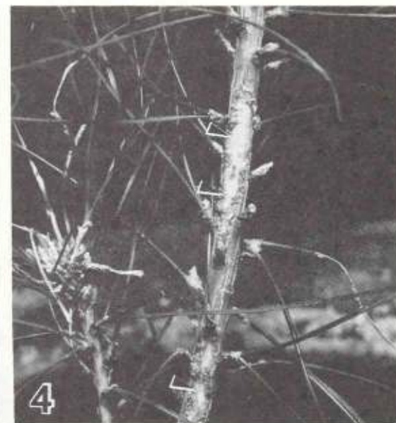
FIGS. 1-4. Emergence trap, oviposition damage, and maturation feeding by Cerambycidae. Fig. 1. Emergence trap for collecting Cerambycidae from pine infested with B. xylophilus . Fig. 2. Cerambycid oviposition niches (arrows) on red pine. Fig. 3. Monochamus scutellatus during maturation feeding on balsam fir seedling. Fig. 4. Maturation feeding damage (arrows) on red pine seedling.