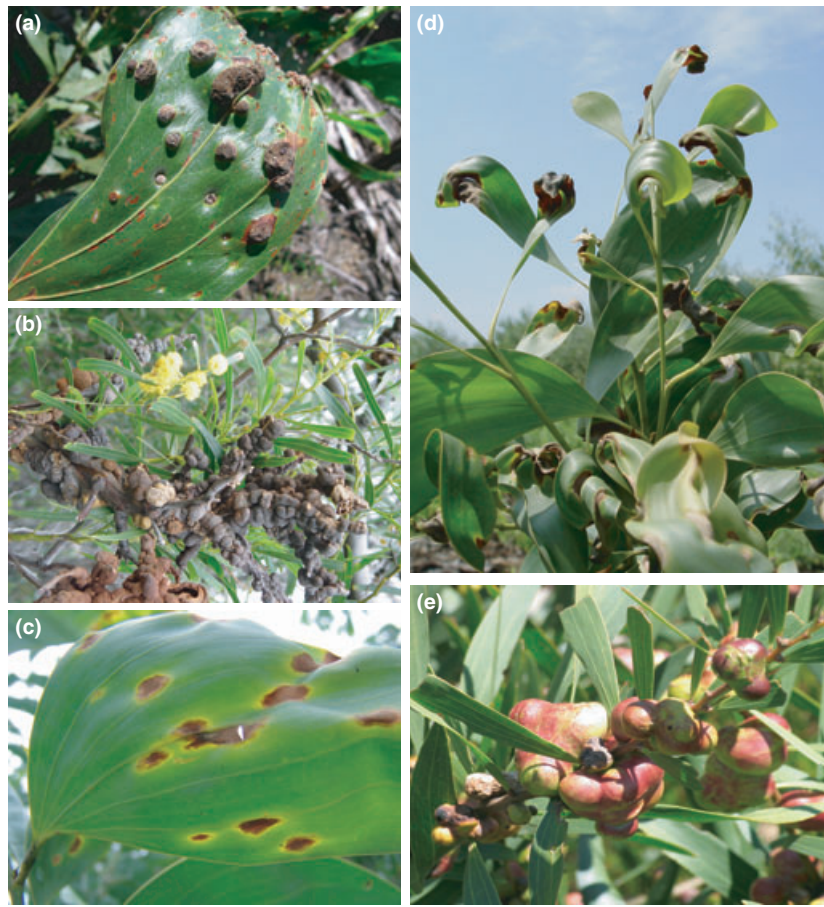
Figure 3 Diseases of non-native plantation-grown Acacia spp. caused by introduced fungi and insects (a) Rust of A. mangium caused by A. digitata in Indonesia, (b) Galls caused by the leaf rust pathogen Uromycladium tepperianum on A. longifolia in South Africa, (c) Leaf spot caused by Passalora perplexa on A. crassicarpa in Indonesia, (d) Leaf blight caused by P. perplexa , (e) Trichilogaster acaciolongifolia on A. longifolia in South Africa.

however, showed that it represented a distinct species (Wingfield et al. , 1996). It was later shown to be the same fungus, also incorrectly identified as C. fimbriata , found on Protea spp. in the 1970s (Roux et al. , 2007).