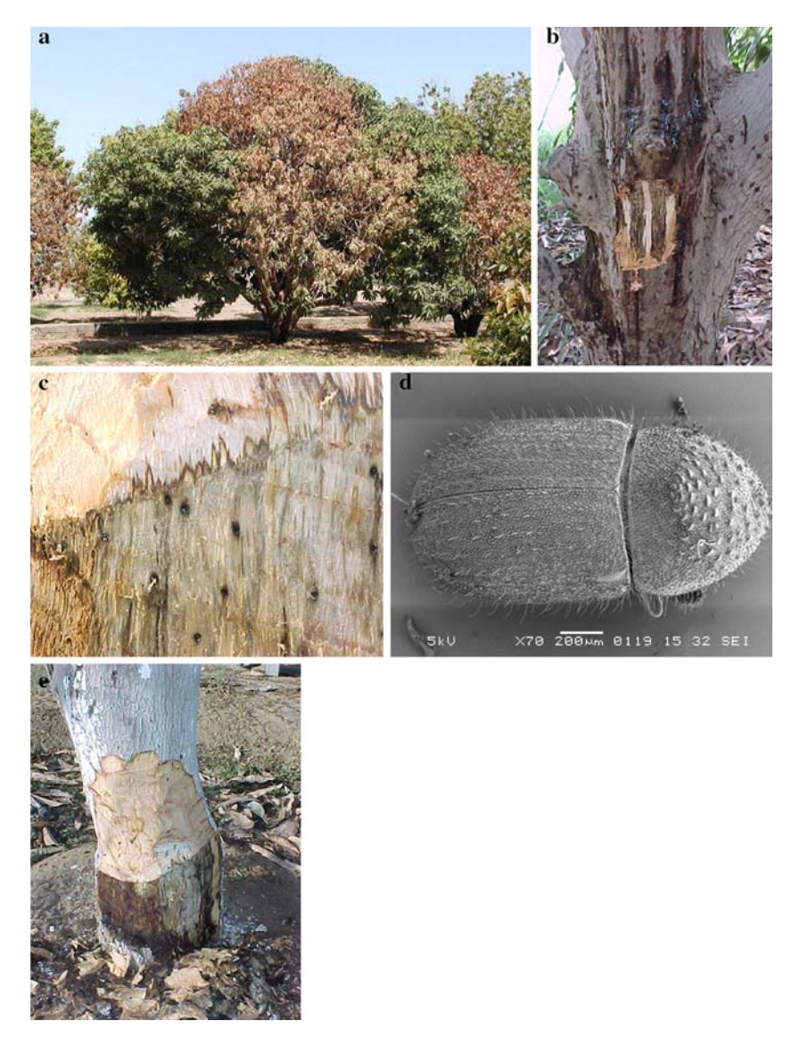
Figure 2. Symptoms of mango sudden decline: (a) branch death; (b) gummosis on bark and vascular discolouration; (c) bark beetle damage; (d) adult bark beetle; (e) dead tree with severely affected rootstock but asymptomatic scion.