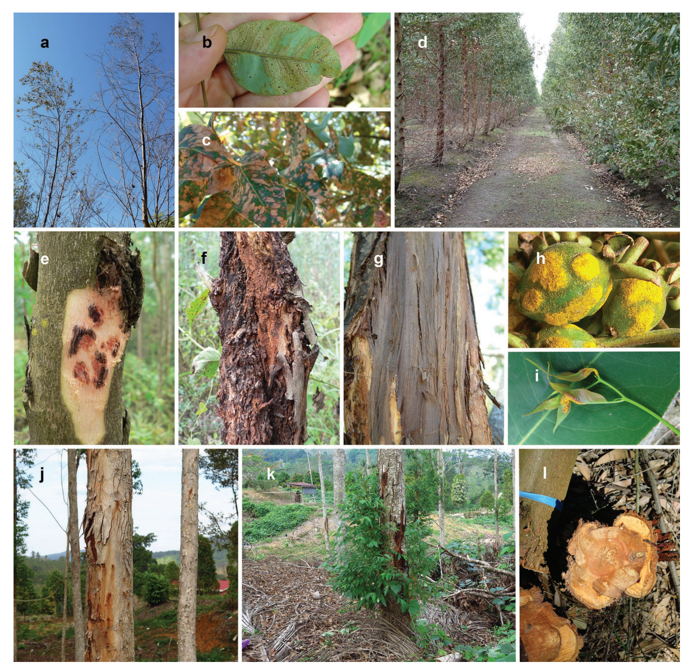
Figure 2. Symptoms of diseases on eucalypts. (a) Defoliation of Eucalyptus grandis x E. camaldulensis hybrid trees caused by Teratospheria viscidus. (b) Teratosphaeria destructans infection on E. urophylla leaves showing profuse production of spores on the abaxial leaf laminas. (c). Teratosphaeria nubilosa leaf disease on Eucalyptus globulus. (d) Defoliation in the lower canopy of trees caused by T. nubilosa in E. globulus plantations; the unaffected trees on the right side of the image were sprayed with fungicide to control disease (Photo G. Hardy). (e-f) Lesions on the stem of E. urophylla cuased by Teratosphaeria zuluensis. In the early stages of infection, lesions are discrete (e), and they later coalesce (f) to form large diffuse cankers (g). Large bark canker with discolored cambium exposed on E. pellita caused by a Lasiodiplodia sp. (h-i). Yellow pustules of the myrtle rust Puccinia psidii on (h) fruits of Psidum guajava and (i) young leaves of E. grandis (j-l). The stem of E. grandis tree with (j) a large canker caused by Chrysoporthe cubensis that can result in (k) girdled stems and epicormic shoots developing below the cankers. (l) A cross-section of the base of a canker caused by C. cubensis on an E. grandis tree.

(Wingfield 1999, Wingfield et al. 2001, 2015, Burgess and Wingfield 2002).