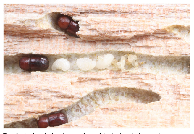
Fig. 1 Ambrosia beetles, such as this Ambrosiodmus minor , are an example of an obligate mutualism between bark beetles and fungi. A. minor depends on its basiodiomycete symbiont Flavodon subulatus (Jusino et al. 2020) for the extraction of nutrients from the dead wood. The fungus, visible here as white mycelium in the tunnels, benefits by being vectored to suitable microhabitats.

In order to accelerate discovery, remain compatible with other cutting-edge research fields, and serve applied end users,