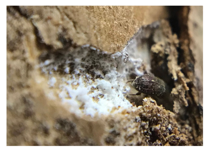
Fig. 2 Most bark beetles live in fungus-saturated spaces, but the cooccurrence does not imply interaction. Here, an unknown fungus flourishes in the tunnel of Hypoborus ficus without any known effect on the phloem-feeding beetle.