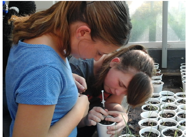
The learners having fun