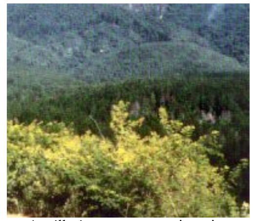
Armillaria root rot centre in a pine plantation.

If you need any further information, please contact us.