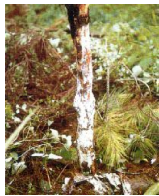
White mycelial mat under the bark of a dead tree.