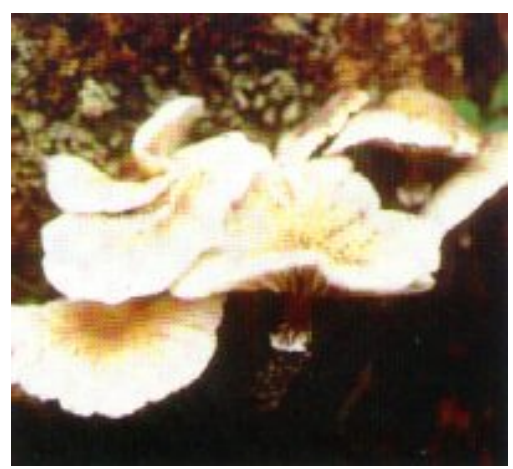
Mushroom like fruiting structures of Armillaria sp. thought to be A. heimii .

Trees affected by Armillaria root rot are usually found in distinct infection centres resulting from a single infected tree. These centres develop due to the