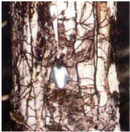
Shoe string like rhizomorphs of Armillaria sp. not seen in South Africa.

to remove in future rotations. Control through selection for resistance in species is a strategy that has been considered. The extremely wide host range of the pathogen suggests that this approach would hold little promise, although it is currently under investigation in South Africa.