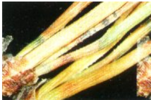
Yellow/tan bands, typical of Dothistroma , on needles.

The disease first appears on the needles on the main stem and at the bases of the lower branches. In wet weather the fungus may spread throughout the tree and cause the loss of all needles except those at the branch tips. Successive years of severe infection result in decreased growth and ultimately death.