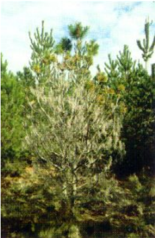
Needle blight on the lower canopy of P. radiata .

some cases has prevented the establishment of certain pine species particularly Pinus radiata . In the 1940s, P. radiata was planted extensively in East and Central Africa but due to severe damage by D. septospora further plantings were suspended. Dothistroma needle blight was first reported in South Africa in the mid-1960s. Today, sporadic outbreaks of the disease occur on P. radiata in the various parts of the Eastern Cape Province.