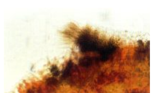
Fruiting body or stroma below the epidermis of a needle.

If you need any further information, please contact us .