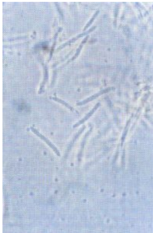
Conidia or asexual spores of Dothistroma septospora .

Many pine species, as well as other conifers, for example Larix spp., are susceptible to infection by D. septospora . Approximately 30 pine species are reported to be susceptible to this fungus. However, P. radiata is by far the most notable susceptible pine species, while P. patula is thought to be the most important disease tolerant species.