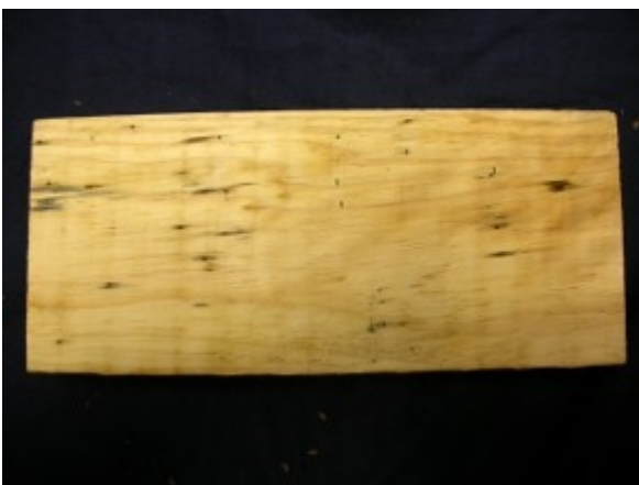
Section of wood showing multiple tunnels