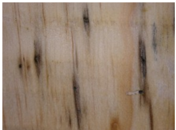
Fungal stain associated with tunneling of ambrosia beetles