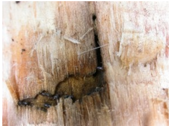
Xyleborinus saxeseni beetles boring in wood