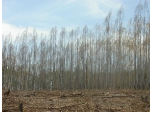
Very severe infestation on eucalypts