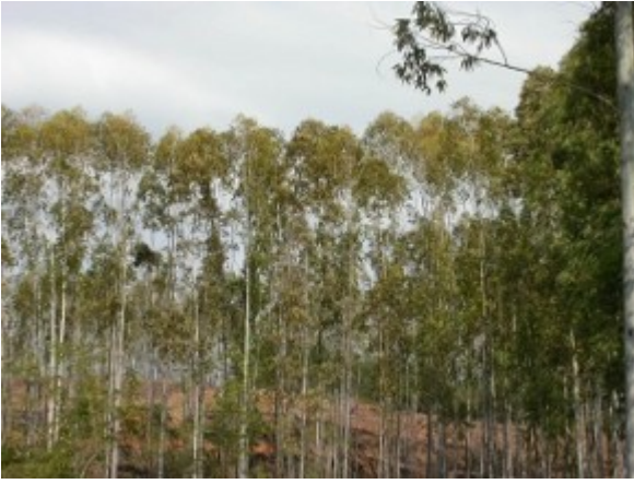
Infestation on eucalypts