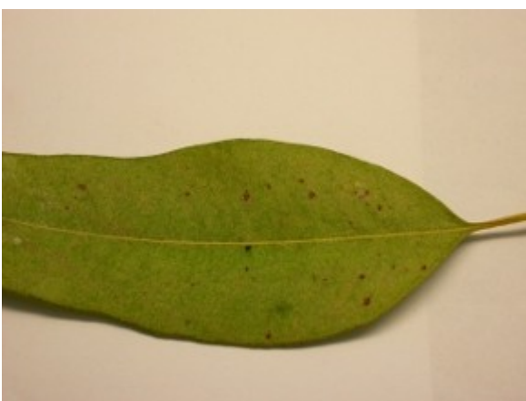
Minor damage on leaf