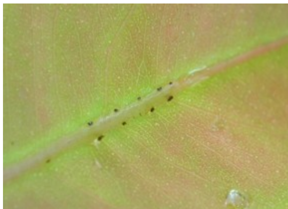
Oviposition marks on midrib of leaf