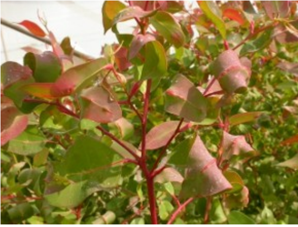
Tree showing heavy infestation