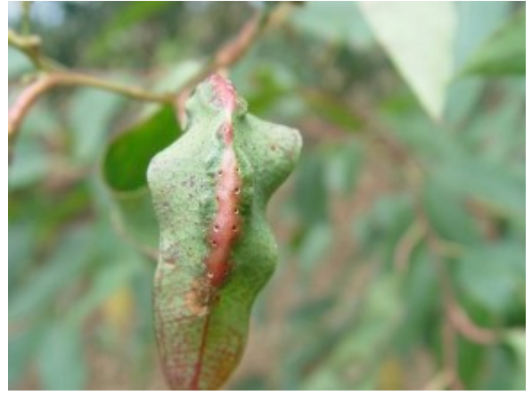
Emergence holes of wasps