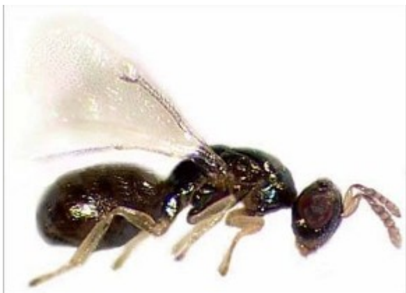
Wasp (1.1-1.4 mm long)

Symptoms: Galls (malformations) on mid-rib of leaves and on petioles and stems; stunted and gnarled looking trees