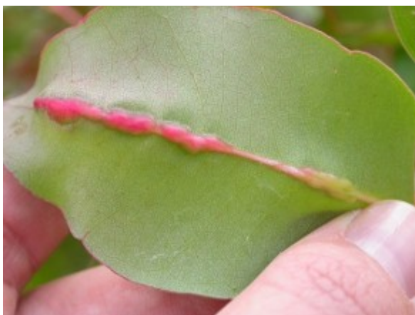
Galls developing on leaf